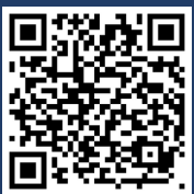
FIELD OFFICE LINK

The EEOC has 53 field offices serving every state and U.S. territory. Our office locations can be found at EEOC.gov . Information about state or local Fair Employment Practices Agencies (FEPAs) that may be available to assist you with your employment discrimination concerns can also be found on each EEOC office webpage , under the "state, local and tribal programs" tab. We also provide EEOC office locations and FEPA information by phone.