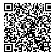
FILE A CHARGE LINK

You can send the EEOC a signed letter describing your employment discrimination concerns. This signed letter becomes what the EEOC calls a "charge of discrimination" that states an employer, union, or employment agency unlawfully discriminated against you. EEOC.gov has a list of information that you need to include in the letter. The EEOC will review your letter and let you know if more information is needed.